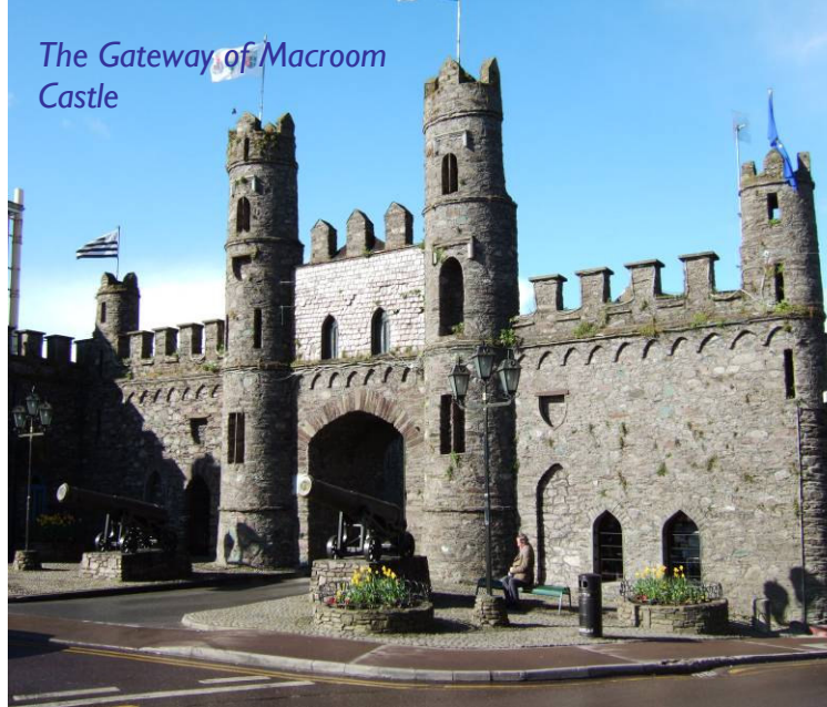
The Gateway of Macroom Castle